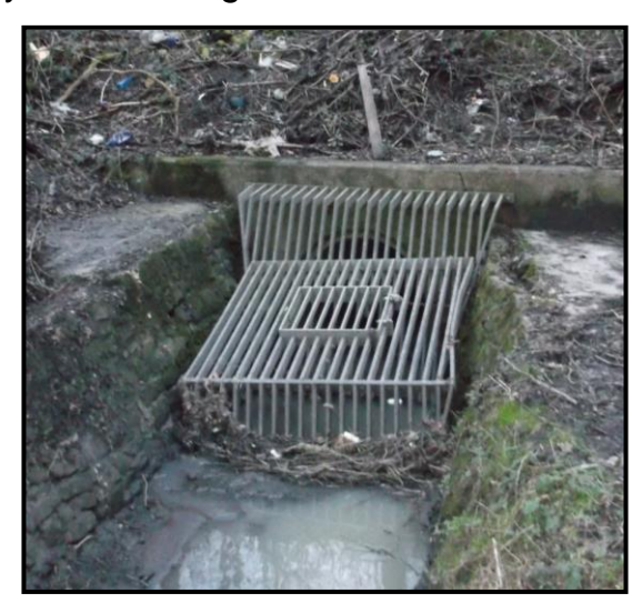
A trash screen

An asset that is defined as having a significant effect on flood risk and therefore warrants inclusion on the Asset Register and Record is one that, should it fail, would have the potential to cause a 'locally significant' flooding event. A 'locally significant' flooding event is defined fully in the Flood Reporting and Enquiries Investigation Guidance Notes but usually involves more than five residential properties being internally flooded.